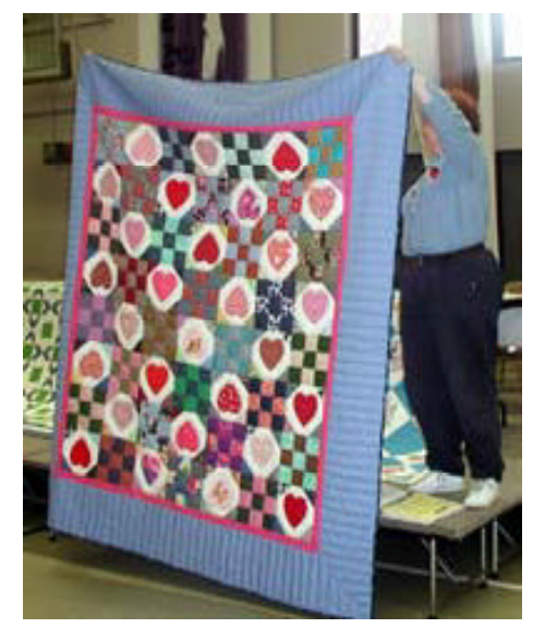
A heart quilt...ideal for entry in the 2003 show, "Deep In The Heart......"